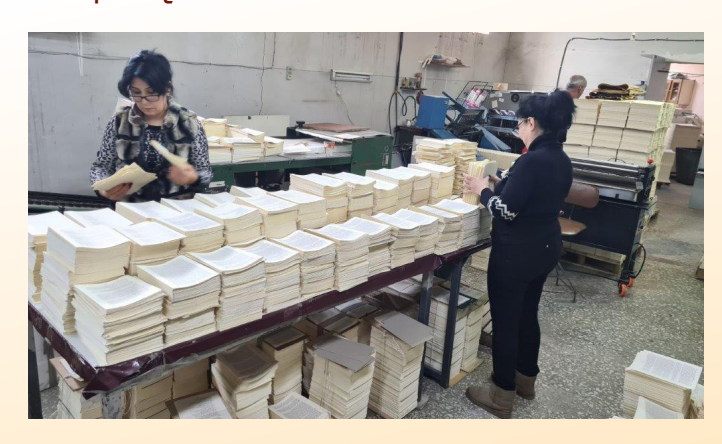
This beautifully crafted volume is a tribute to the amount of care put into it