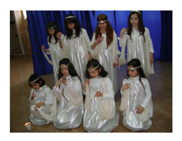
These little girls perform on stage a scene taken from Armenia's Christian history

"I used to compare the human soul as an empty hole which cannot remain empty for a long time: sooner or later it will be filled with muddy waters if you are not consistent and conscious. You have to do your best to be able to find the pure source of water which will fill your heart with Light. And the only pure water of life is God's Word; and for me, that life-giving source was the ministry of Reformed Faith and Life."