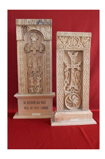
These "khatchkars" carved in wood are a traditional expression of the Christian faith of the Armenian people through the centuries